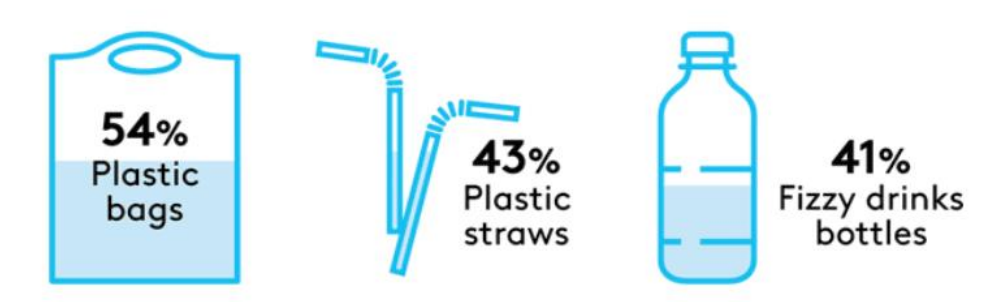
Top 3 items for those who will reduce use