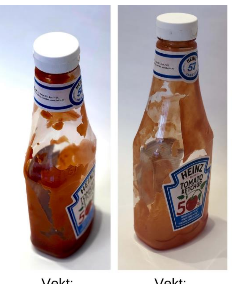
Vekt: 195,6 gram